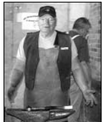
Sandy Spring Museum's blacksmith