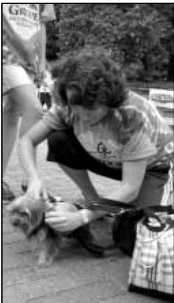
A four-footed friend suits up for the Memory Walk.