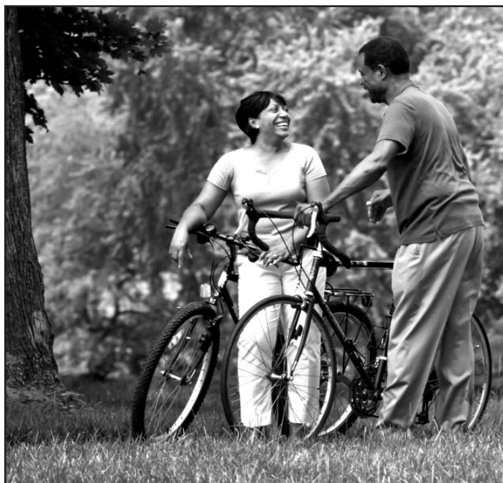
Live well! Explore Brooke Grove Retirement Village and its Community Health Fair for Seniors on October 12.

home safety tips will also be discussed. The seminar will be offered at 11 a.m. and again at 1 p.m.