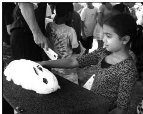
A young visitor pets a rabbit from D's Magic Show.

group joined residents for an ice cream social, bubble blowing, temporary tattoos, hula hooping and D's Magic Show.