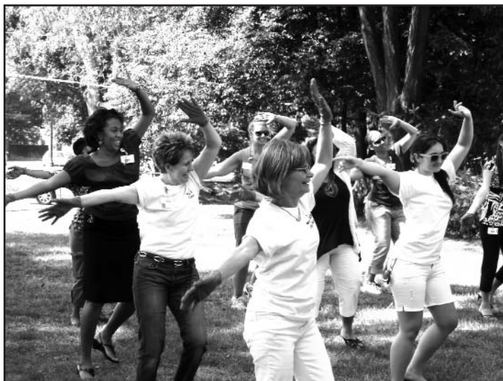
Line dancers get into the groove.