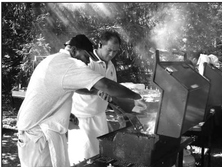
Cheeburger Cheeburger chefs grill burgers for the crowd.